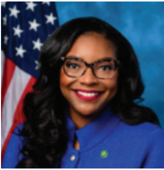
CONGRESSWOMAN EMILIA SYKES

Born and raised in Akron, Ohio, Congresswoman Emilia Strong Sykes grew up on the city’s west side and has dedicated her career to strengthening her community. For eight years, Emilia served as the State Representative for Ohio House District 34, otherwise known as the “Birthplace of Champions.” During that time, she served for four years in Democratic leadership, including three years as the House Minority Leader. In